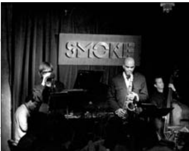
Tom Harrell Quintet, Smoke